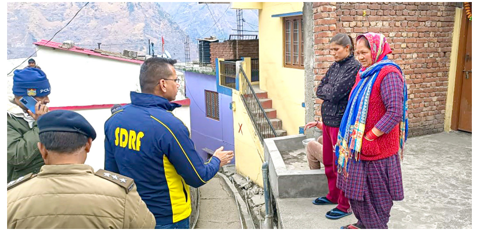
SDRF personnel interact with people after cracks appeared in their houses due to the gradual 'sinking' of Joshimath in Chamoli district of Uttarakhand on Monday.

The district administration had put red crosses on more than 200 houses in the sinking town that are unsafe for living. It asked their occupants to either shift to the temporary relief centres or rented accommodation for which each family will get assistance of INR 4000 per month for the next six months from the state government.